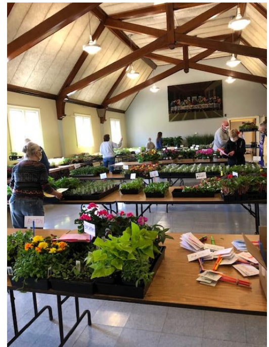
Kenmore UCC hosts plant sale

Churches and individuals are being asked to continue to donate to their housing units to ensure continued existence in coming years. If you or your church can, contact your denomination house administrators to see what you can do to assist in these matters. Chautauqua is a blessing for us here in Western New York.