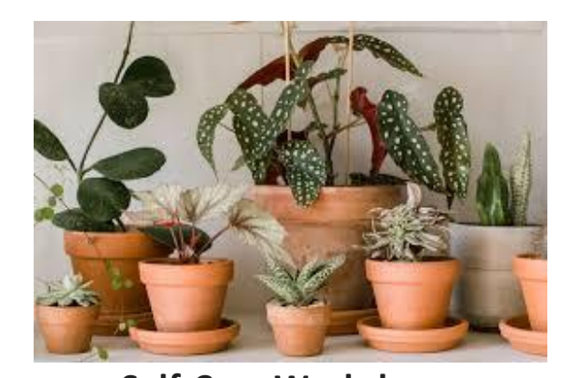
Self-Care Workshop Title: Creative Succulent Garden Presenter: Educator from the Buffalo and Erie