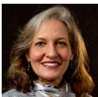
Divar Consortium in Israel/Palestine.