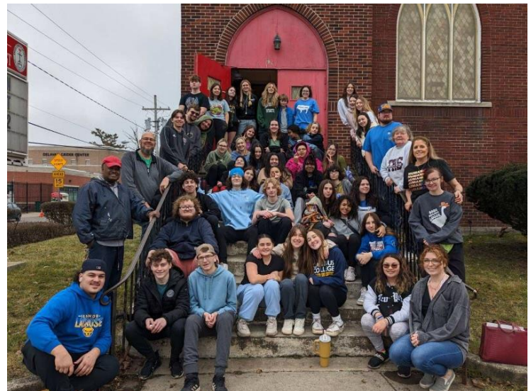
Winter WAY Retreat February 2024

Your church's support in furthering our youth mission is greatly appreciated!