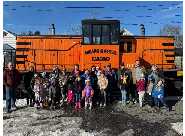
The Winter VBS at Arcade UCC takes to the rails!

For the second year in a row, Arcade UCC hosted their Christmas Extravaganza for the students of Arcade Elementary! Over the span of three days, every classroom from Arcade Elementary visited Arcade UCC to enjoy a read-aloud story and a fun experiment presented by the Happy Scientist! Holiday spirit was high and smiles were on every face! What a wonderful way to connect with so many of our area youth!