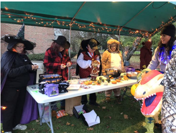
Halloween fun with the community at Grace United Church of Wellsville

A few short days later on Halloween, Grace United handed out candy to the hundreds of children who passed by the church while out trick-or-treating. Everyone was in the Halloween spirit and dressed in costume, much to the children's delight!