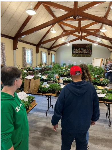
Kenmore UCC's Annual Plant Sale in May 2025.

Congratulations, Kenmore UCC on 99 years!