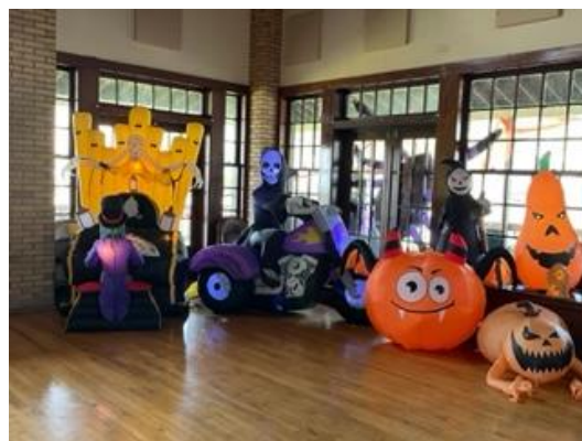
Dunkirk Halloween Happening