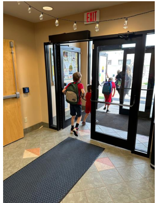
Students leave with their free backpacks filled with school supplies for the upcoming year.

For the second year in a row, Arcade UCC provided a free school supply giveaway for Pioneer Middle and High School students. While the elementary schools within the district provide the needed supplies for their students, families of middle and high school students are given the opportunity on a first-come, first-serve basis to gather their school supplies at Arcade UCC.