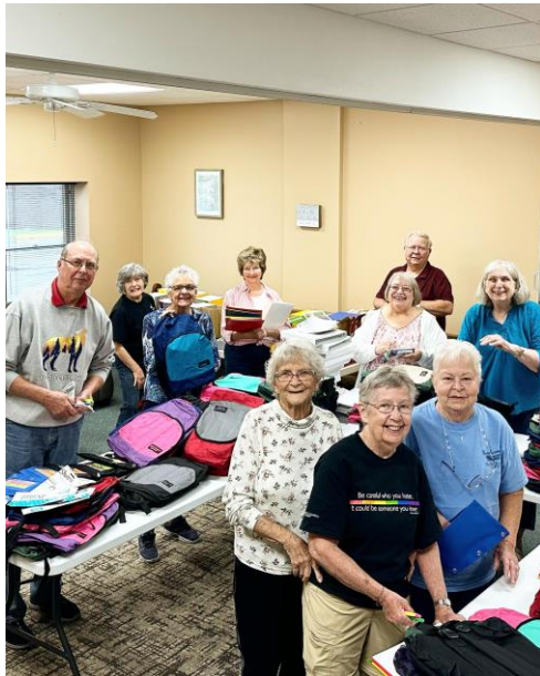
Members of Arcade UCC help to fill backpacks with school supplies for the Pioneer middle and high school students.