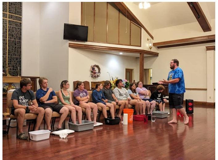
The closing worship and blessing with washing of the feet of the seniors.