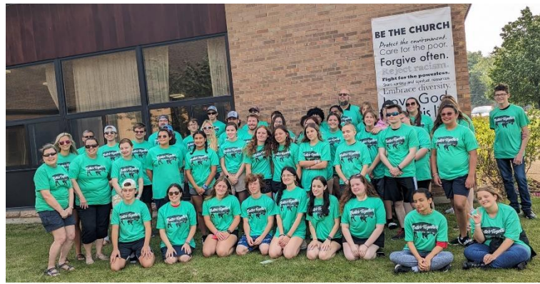
The WAY group poses for a picture at the start of their Mission week.