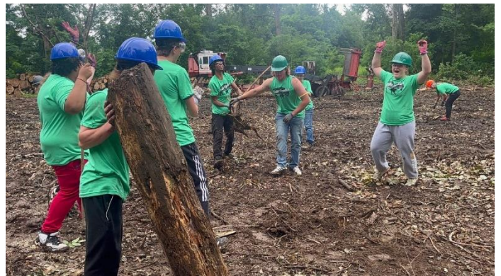
The youth helped to clear a property for North Country Habitat for Humanity's 2023 Veteran Build.